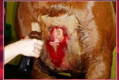
Stake injury – Image courtesy of Greg Quinn, Chine House Veterinary Hospital